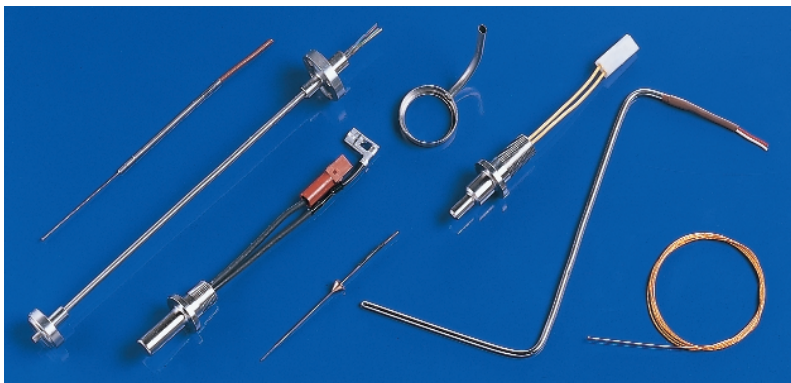
sensors, temperature control